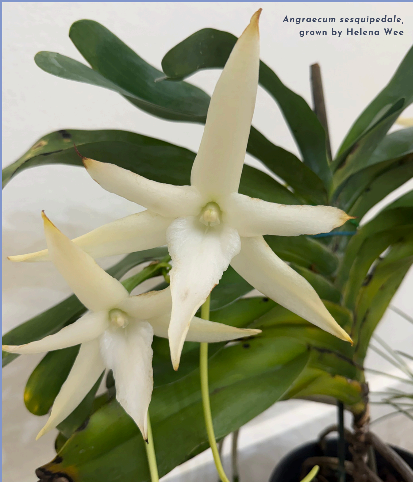
Angraecum sesquipedale , grown by Helena Wee