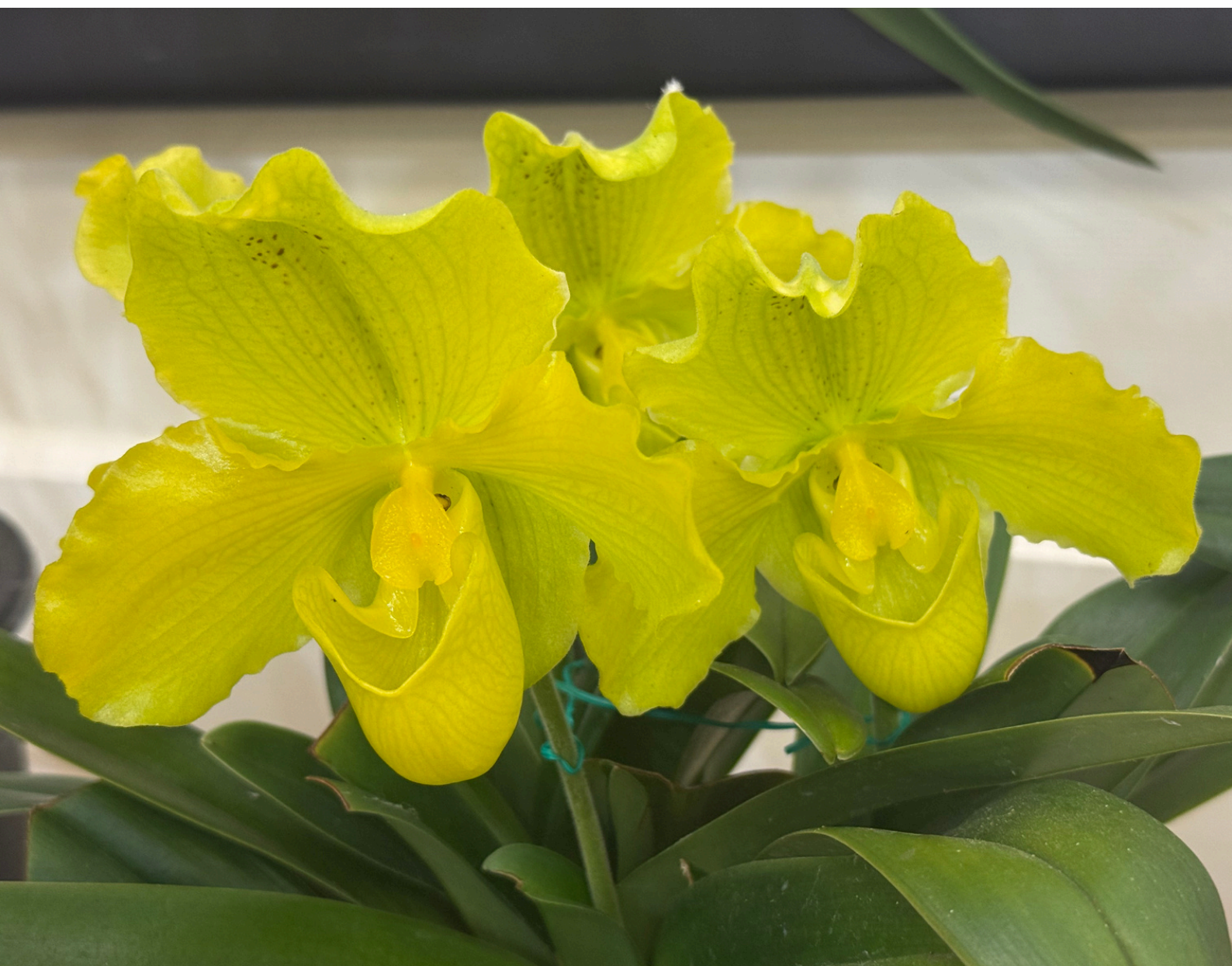
Paphiopedilum Agnes Wong, grown by Linsie Hu