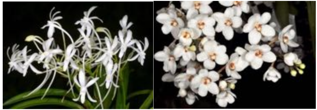
Vanda falcata & Sarcochilus hartmannii