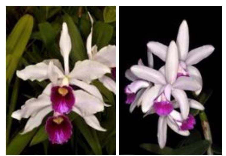
Cattleya (formerly Laelia) pupurata & Cattleya intermedia

Probably the most familiar orchid grown outdoors in the Bay Area, Cymbidiums come from Asia & Australia and are ideally suited to our moderate temperatures and cool evenings. Preferring bright light and to be kept evenly moist in the summer, most Cymbidiums can handle temperatures down into the mid 20's as long as they are kept on the dry side throughout the winter.