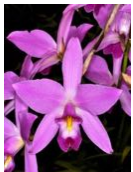
Laelia anceps.

Dendrobium jenkinsii. These last two prefer to remain quite dry in the winter months, actually blooming better if left unwatered between Thanksgiving and Valentine's Day.