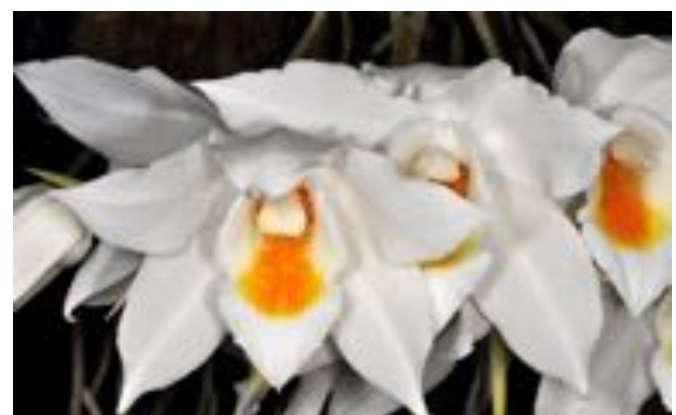
Coelogyne mooreana "Brockhurst" FCC-RHS

This mostly white flowered genus is found throughout Southern and Southeast Asia. The ideal outdoor growing candidates come from the foothills of the Himalayas and higher evaluation areas of Vietnam and China. Coelogyne mooreana has large, crystalline white flowers that last for several Other fine choices include Coelogyne weeks. cristata, Coelogyne corymbosa and Coelogyne nitida. All benefit from greatly reduced watering in winter, and are quite cold tolerant as long as they are kept dry.