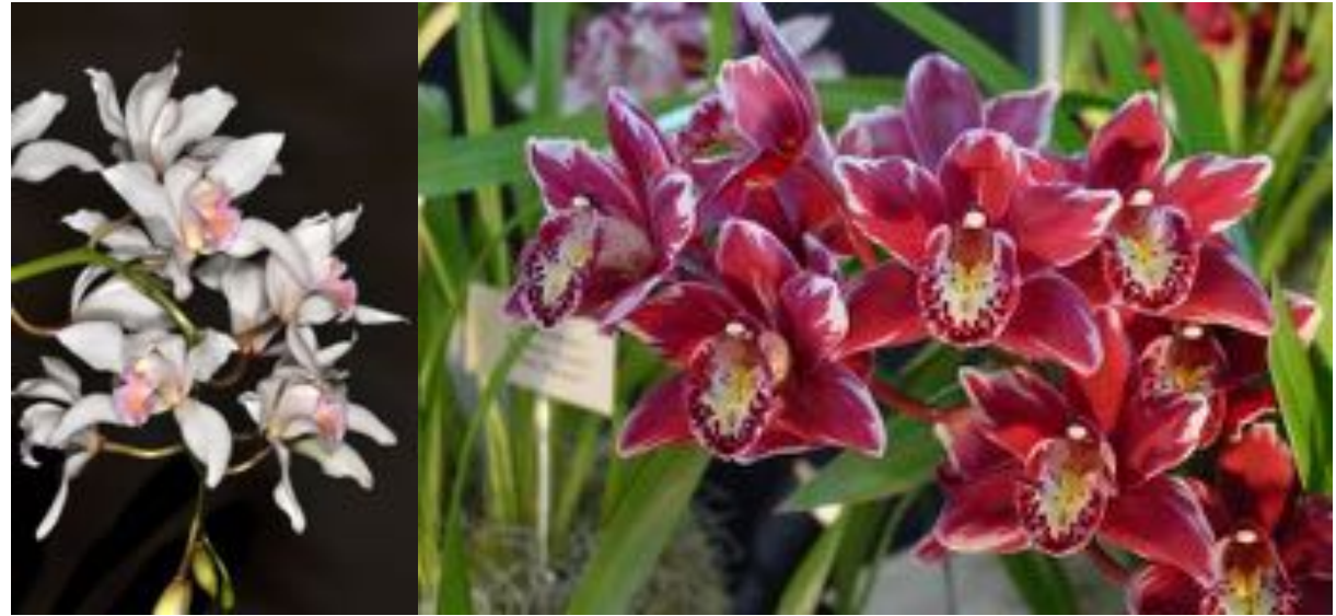
Cymbidium insigne "Lyi", Cymbidium Winter Fire "Splash"