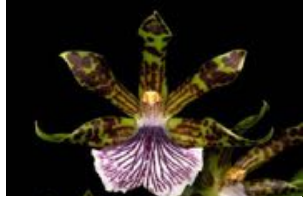
Zygopetalum crinitum candidates for outdoor growing.