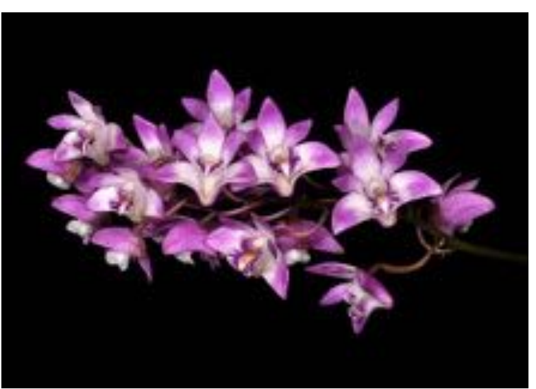
and Dendrobium kingianum.

Native to Asia, Australia and some Pacific islands, Dendrobiums come from a wide variety of habitats. Some of the best suited to outdoor culture in the Bay Area come from Australia, the foothills of the Himalayas, Japan and higher elevations in China. Dendrobium kingianum is one of the easiest of all orchids to grow outdoors. Indifferent to all but the most extreme temperatures and tolerant of neglect, this is an ideal orchid for the beginner. Other qood choices are Dendrobium moniliforme. Dendrobium Dendrobium nobile speciosum,