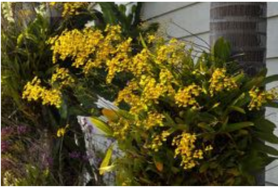
Gomesa flexuosa (formerly Oncidium flexuosum)

While most Vanda and Phalaenopsis species cannot survive outdoors in coastal California, they have some close relatives that thrive under our conditions. Vanda (formerly Neofinetia) falcata, the "Samurai Orchid" is native to Japan and prized there for its diminutive beauty and sweet fragrance. Sarcochilus hartmannii originates in Australia and covers itself in white flowers with pink centers every spring. Vanda falcata does best under medium light levels, while Sarcochilus hartmannii prefers more shade. Both need to be kept drier in winter, with preferably little or no water ever touching their leaves during the coldest months. For the adventurous, Holcoglossum flavescens and Phalaenopsis wilsonii are two additional options that do quite well outdoors, but both require being grown on a mount.