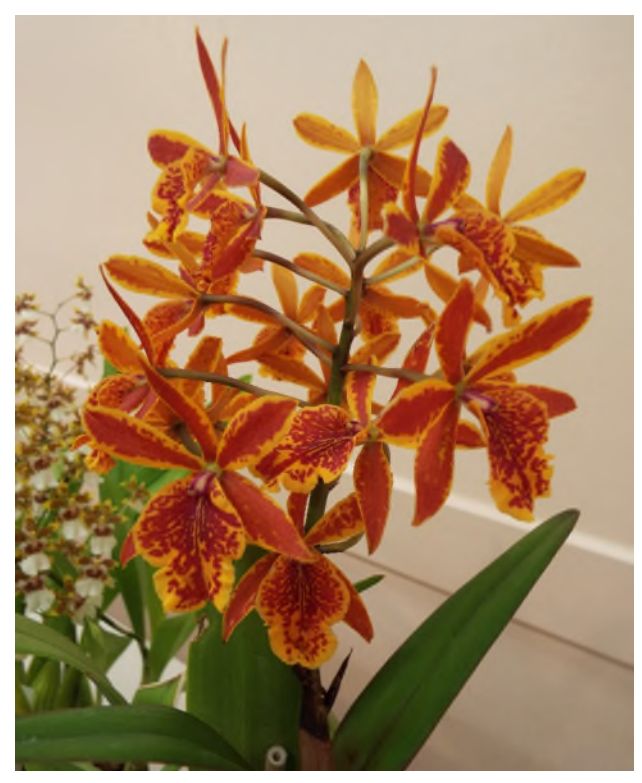
Lc. Irene's Song 'Montclair' HCC/AOS - Janusz