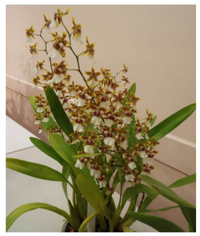
Onc. Sphacetante 'Evelyn' AM/AOS - Janusz