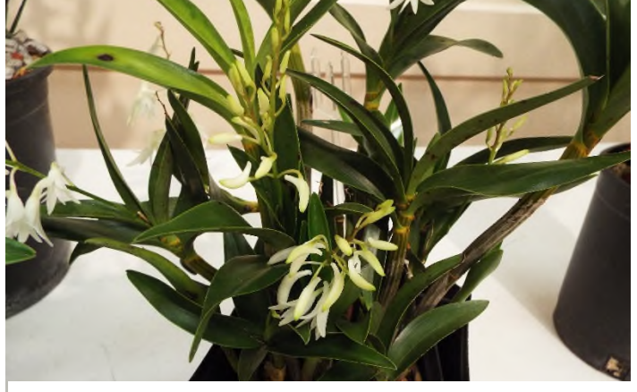
Dendrobium moorei - Asuka