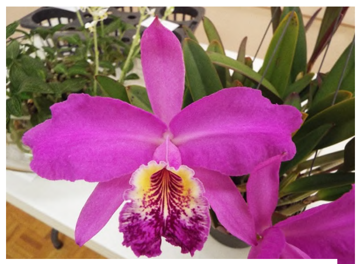
C. leuddemaniana – (another view)