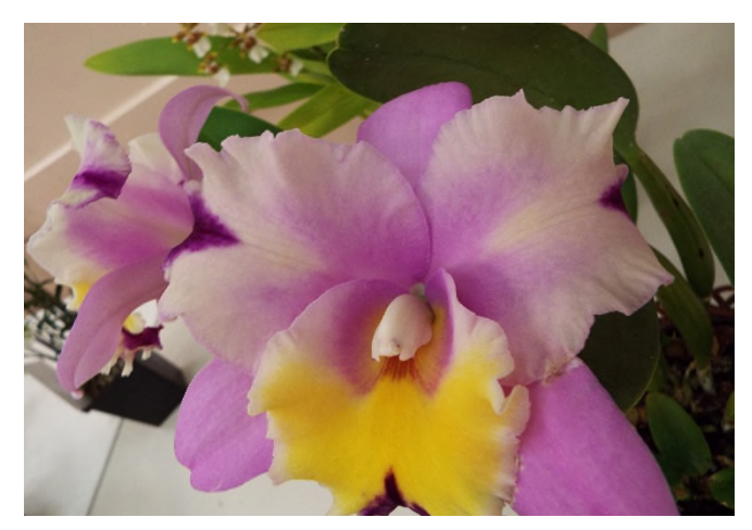
Lc. Irene's Song 'Montclair' HCC/AOS - Janusz