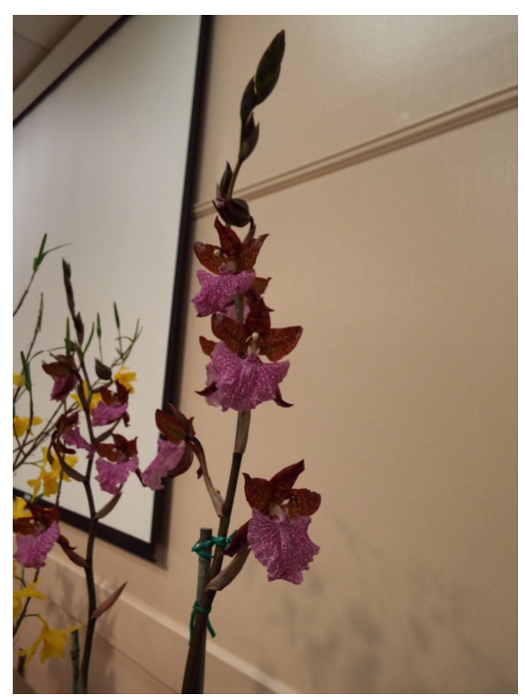
Odont cordata - Asuka