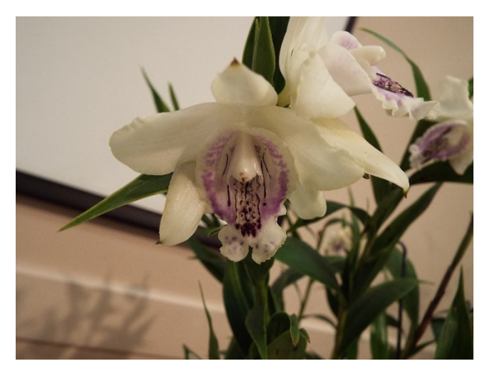
Sobralia maduroi (sp?)- Asuka (3<sup>rd</sup> time to bloom in 21 years