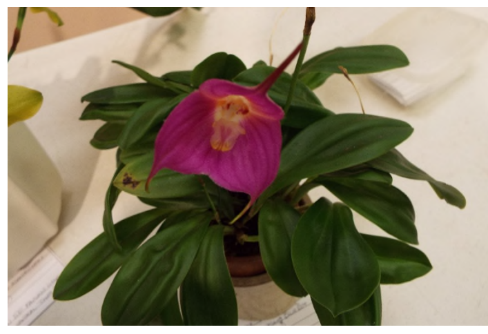
Dracuvallia Blue Boy 'Cow Hollow' – Linda Tripp