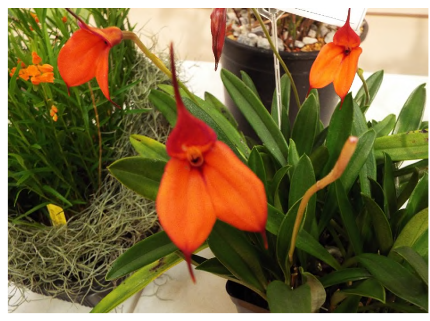
Masd. Welischii 'Rip-Hoff' - Asuka