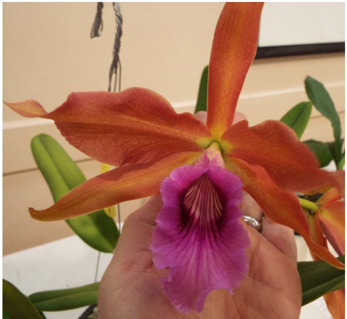
L. tenebrosa