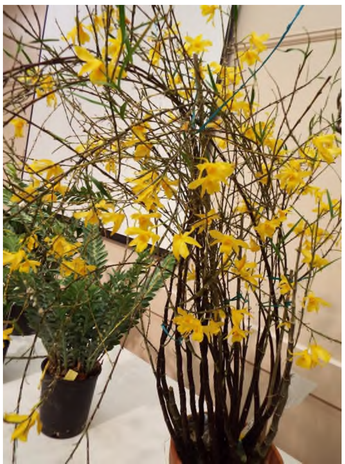
Den. hancockii - Asuka