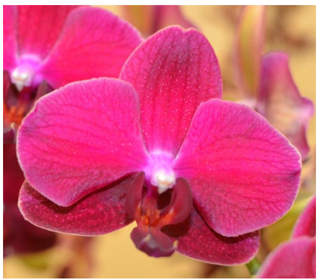
Phalaenopsis Desert Dream AM/AOS Janusz Warszawski