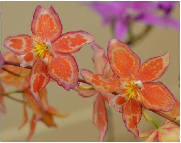
Oncidium Jacob's Coat 'ROC' Chaunie Langland