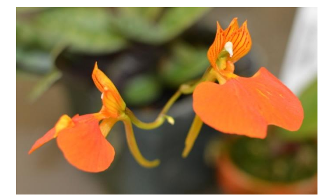
Comparettia speciosa Chaunie Langland