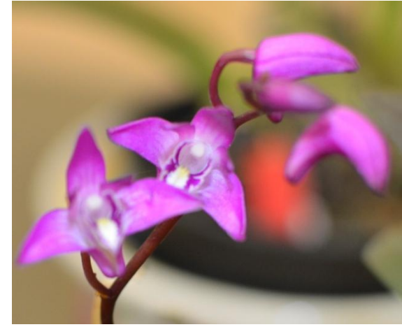
Dendrobium kingianum Pat Proctor