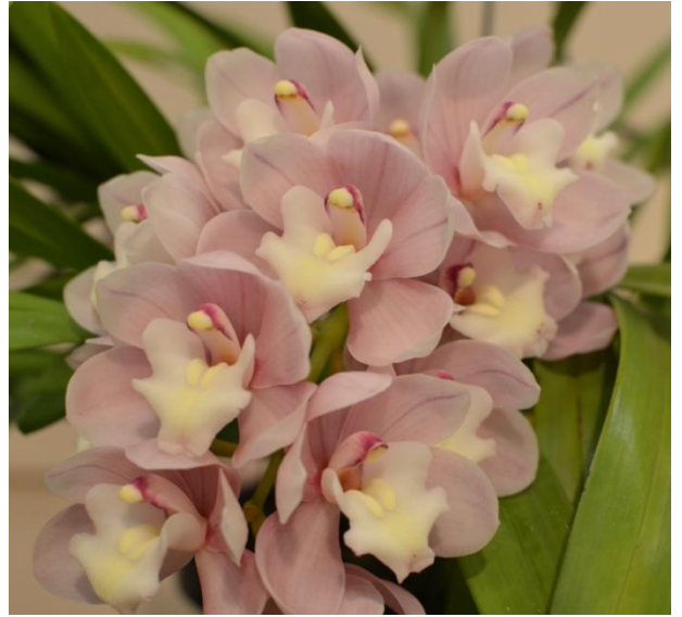
Cymbidium Lady Sarah 'Bridal Veil' Pierre Pujol