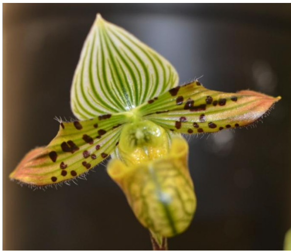
Paphiopedilum venustum Chaunie Langland