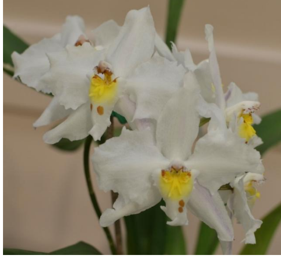
Oncidium San Francisco Silver Anne Reigel