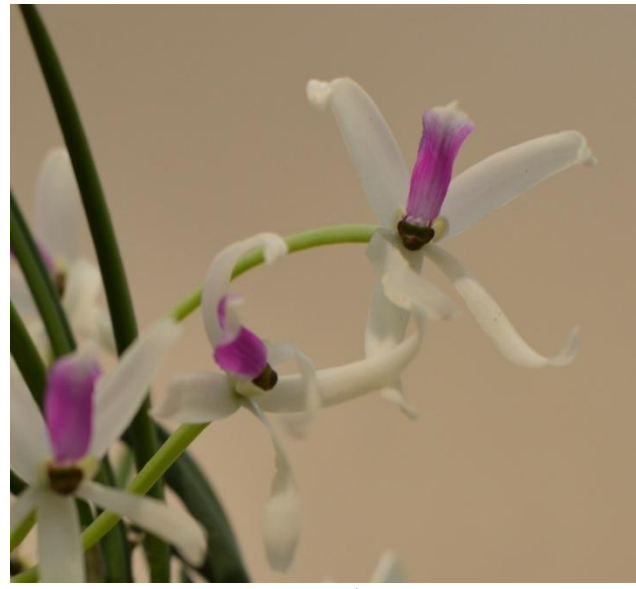
Leptotes bicolor Tanya Lam