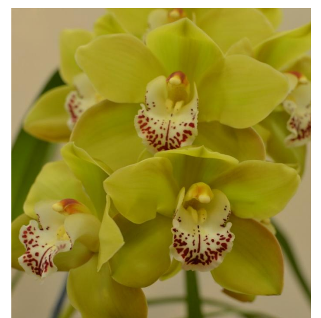
Cymbidium Lucky Shamrock "Green Glen' HCC/AOS Chaunie Langland