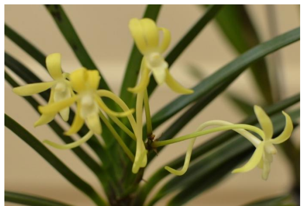
Neofinetia falcata (yellow variety) Linda Tripp