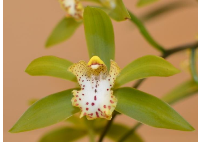
Cymbidium hookerianum 'Cinnabar' Pierre Pujol