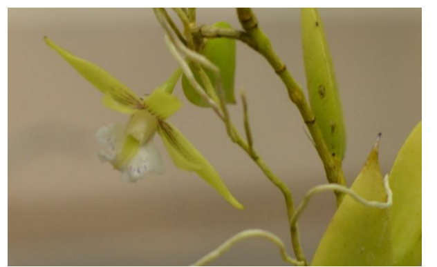
Dockrillia pugioniformis