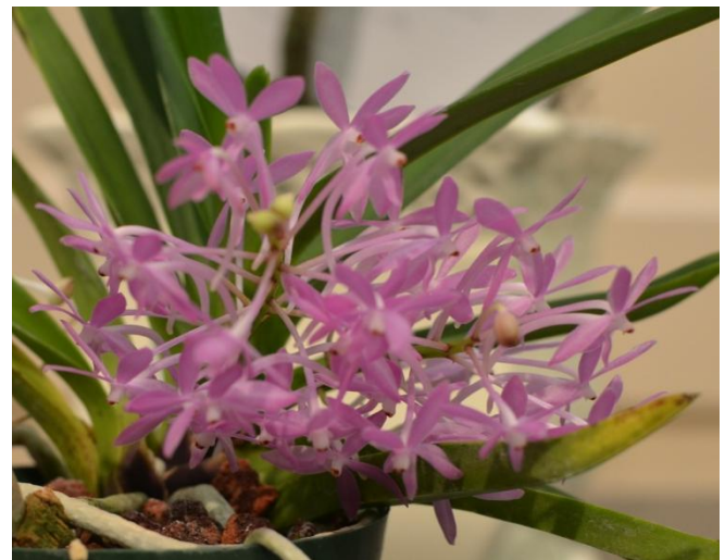
Ascofinetia Cherry Blossom Tanya Lam