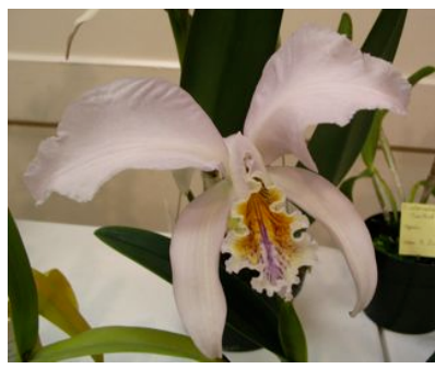
C. mossiae var. coerulea