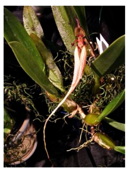
Bulb. Louis Saudar