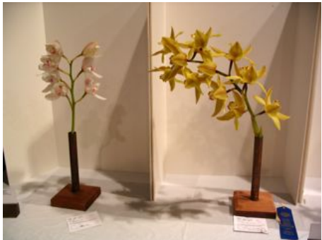
Cut flower division