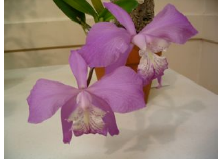
L. speciosa