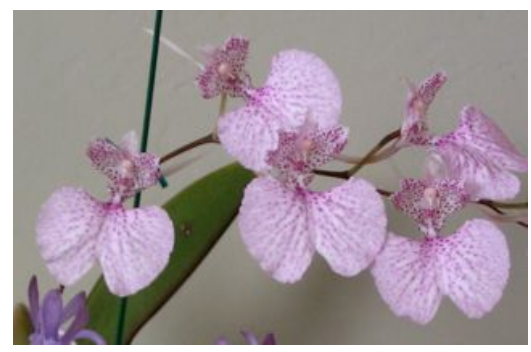
Comparettia macroplectron. Chaunie Langland