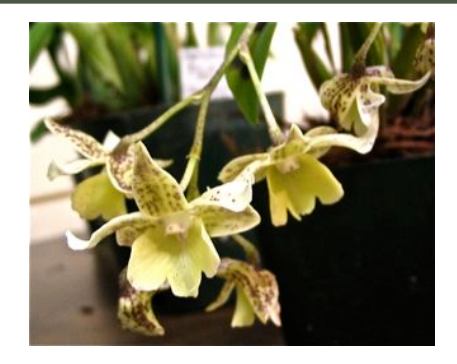
Den. Aussie's Chip The Staals