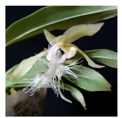
Kefersteinia mystacina Chaunie Langland