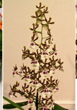
Odcdm. Wild Willie The Staals