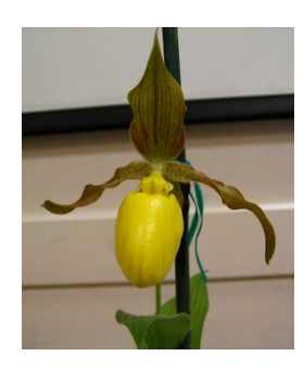
Cypripedium pubescens Randall Takemoto-Hambleton