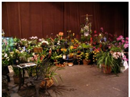
The overall display was stunning

Carmel has combined their show with a general garden show. This makes it extra fun to visit. The weather was great and the amazing specimen plants entered in their show knocked my socks off. They had an extra beautiful display this year. Congratulations on a wonderful show!