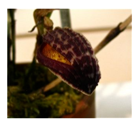
Zootrophion dayanum. Ginette Sanchou