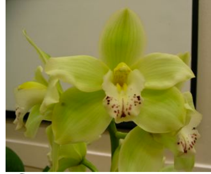
Cym. no name Randall Takemoto-Hambleton