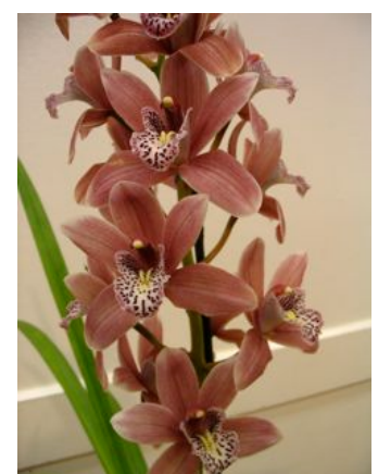
Above - Max. sanguinea