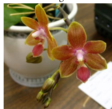
Phal. Kuntrarti Rarashati 'Copperstate', Cordelia Wong HCC/AOS