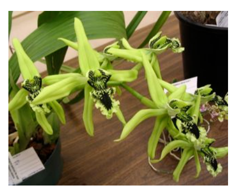
Ceologyne pandurata 'Rio Verde' Randall Takemoto-Hambleton