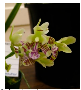
Sedirea japonica Randall Takemoto-Hambleton