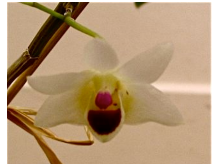
Den. guangxiense Cordelia Wong