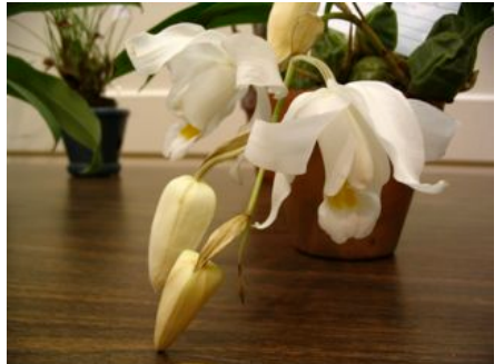
Coelogyne cristata Annie Green