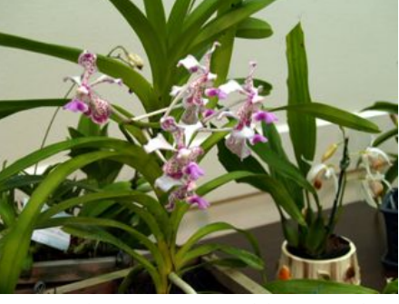
Phal. hieroglyphica