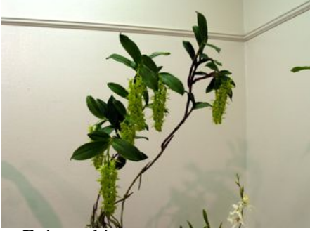
Epi. carchiense