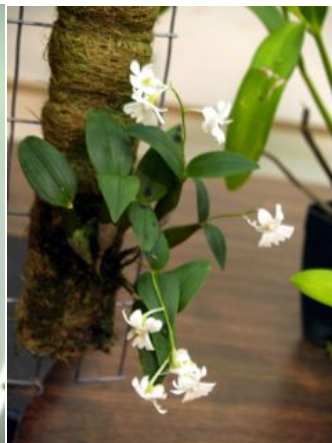
Den. Maiden Charlotte x aberrans The Staals