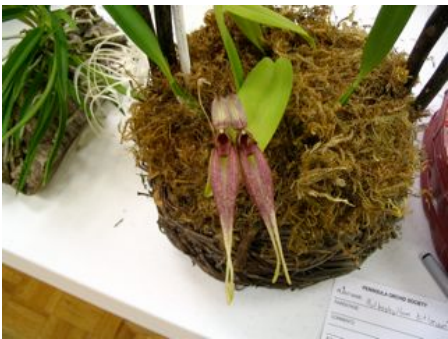
Bulb. biflorum. 'Lil'