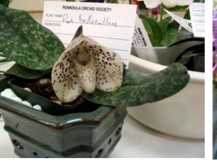
n. Cordy Wong