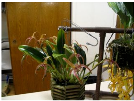
Some of the entries for AOS judging