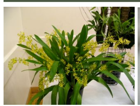
Onc. chrysomorphum. 'Marion' CBR/AOS The Staals