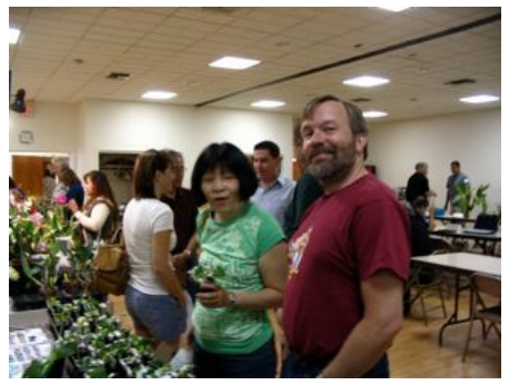
Cordy and Fred picked up a few plants from the sales area