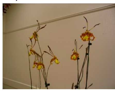
A nice variety of Psycopsis hybrids Dend. bracteosum. Tanya Lam