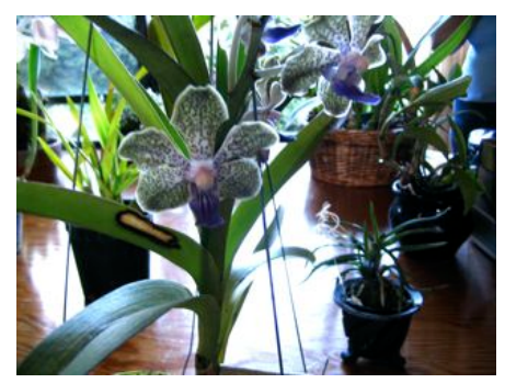
V. tessalata x V. denisoniana