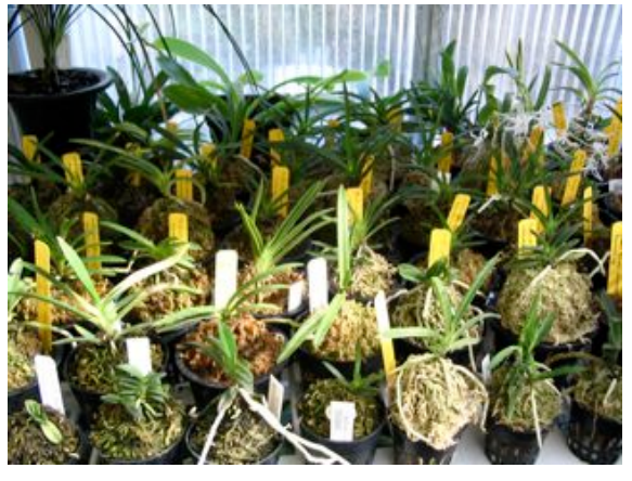
Top L to R: Sedirea japonica variegated leaves; Phal. Brother Pepride x Phal. violacea; Neof. falcata

Middle L to R: Phal. Shenandoah Fire; another type of attractive Phal. leaf; Den. . stratiotes x Den.. antennatum.