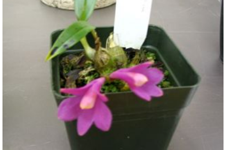
Rex Castell Den. brevifolium