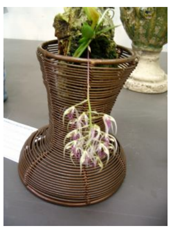
Macroclinium_ manabinum_ Ginette Sanchou