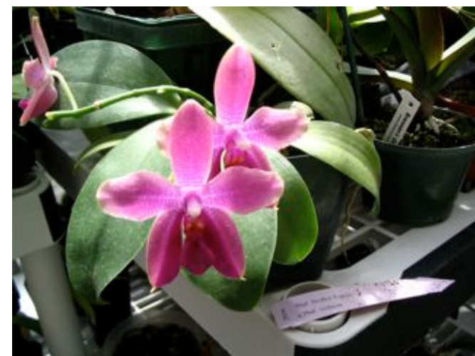
Phal. Brother Pepride x Phal. violacea