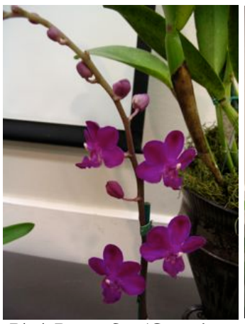
Phal. Rising Sun 'Gertie'