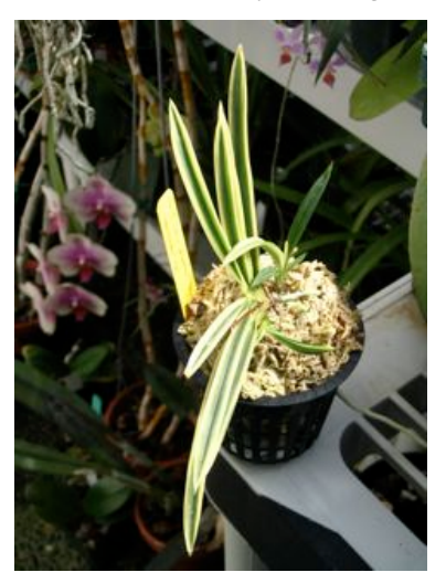
A variegated leaf Neof. falcata