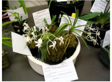
Four Neof. falcatas