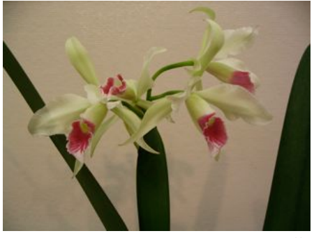
L. purpurata v. carnea