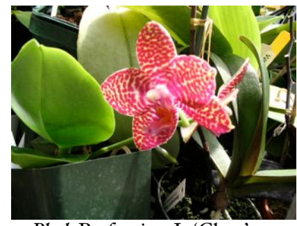
Phal. Perfection Is 'Chen' FCC/AOS