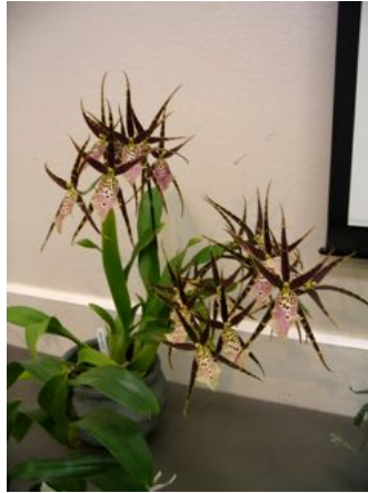
Mtssa. Shelob 'Webmaster' AM/AOS Gloria Bygdnes HCC/AOS Chaunie Langland