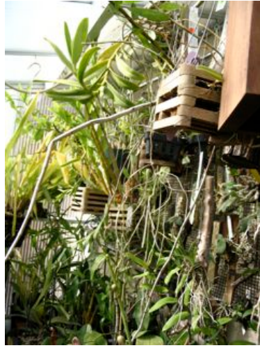
Making the most of the greenhouse space