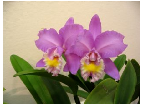
C. Winterland 'Floralia'