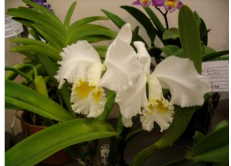
C. mossiae v. alba