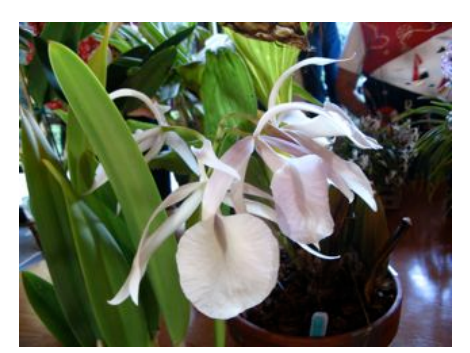
Bl. Morning Glory