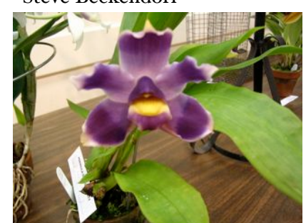
Bollea coelestis Chaunie Langland