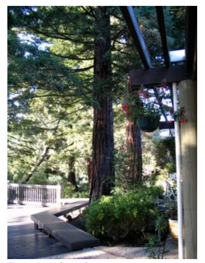
It was a lovely summer evening at the San Mateo Garden Center