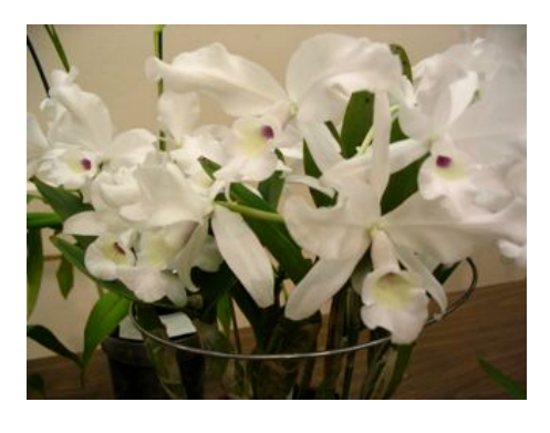
Large, well flowered C. skinneri