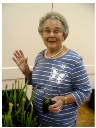
Gloria mugs for the camera as she chooses a carnivorous plant