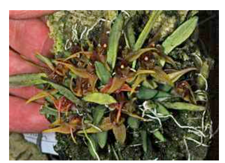
Dryadella edwalli