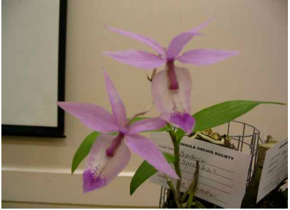
Barkeria spectabilis Ginette Sanchou