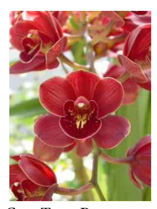
Cym. Tanya Porter 'Cinnabar'