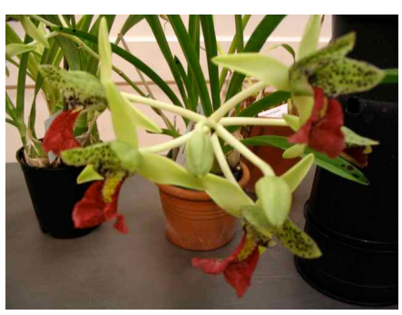
Cymbidiella pardalina