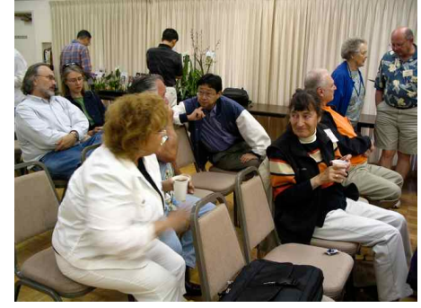
Members and guests had a good time visiting before the meeting began.