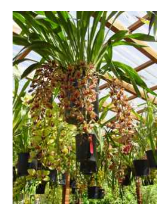
Cym. Miss Muffet